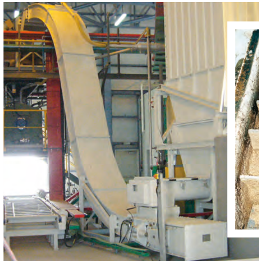
➤ 07 | Drag chain conveyor (inside and outside)

The silo plants for the additives are filled pneumatically. A pneumatic pinch valve which is controlled via a level switch protects the silo against over filling.