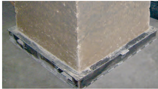
➤ 15 | Mould (treated waste) after removal of the form/shattering

Depending on the specification of the waste to be treated and the specification of the final product, the final product of the SOLIDIFICATION will be re-integrated at site, disposed and integrated at approved landfills or used for construction e.g. base layer of roads or core of dykes and banks.