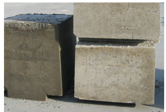
➤ 04 | Solidified Mold (Concrete Block)

Furthermore the final product of SOLIDIFICATION can be casted to molds. The hardened molds can be reused or integrated into a landfill.