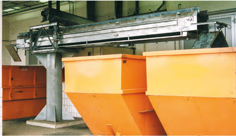
➤ 12 | Loading belt conveyors in operation