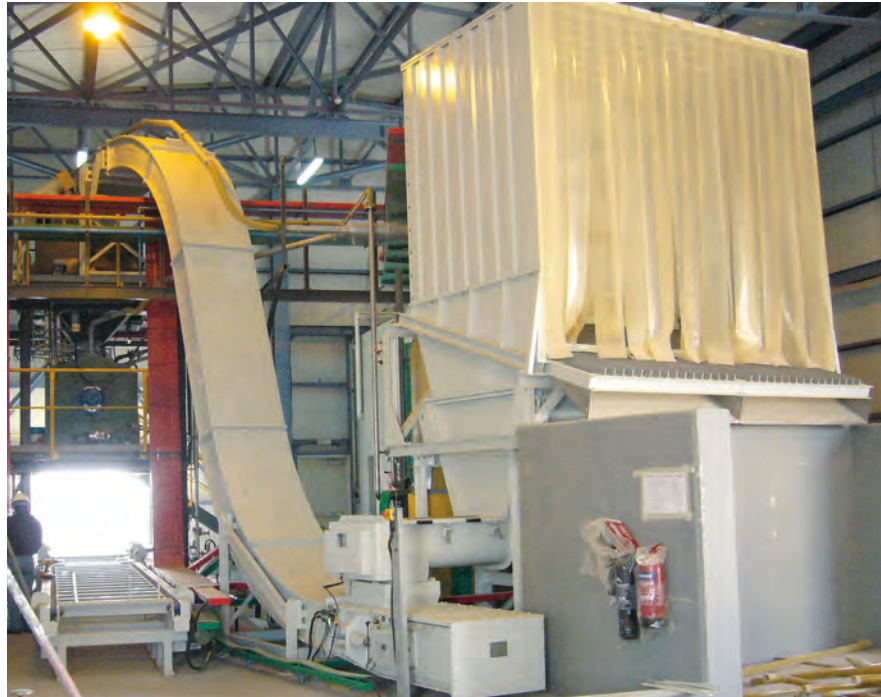
➔ 01 | SOLIDIFICATION-Plant

Handling of the Final Solidified Product