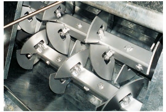
➤ 10 | Double shaft mixer (inside, new)