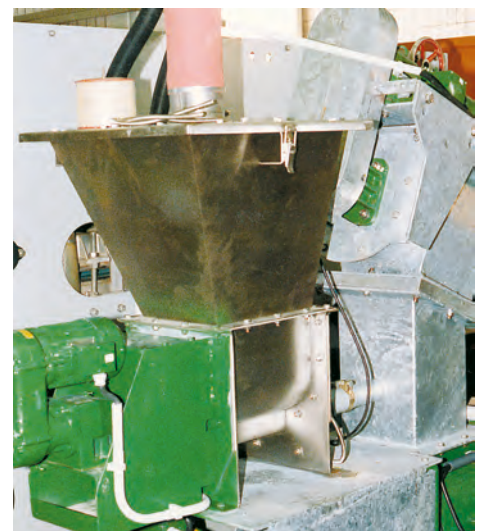
➤ 08 | Volumetric dosing unit

In general the gravimetric dosing takes place batch wise via weighing drums, which are located on weighing cells. Continuous weighing systems are used in special applications only, if the specification of the dosing material enables the use of a continuous weighing system. Specifically for the input material / waste the use of continuous weighing systems is limited because of the specification of the waste and the variation of the specification of the waste materials.