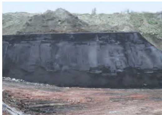
➤ 16 | Integrated final solidified product (monolithic block))

Furthermore the final product of SOLIDIFICATION can be casted to molds. The hardened molds can be reused or integrated into a landfill.