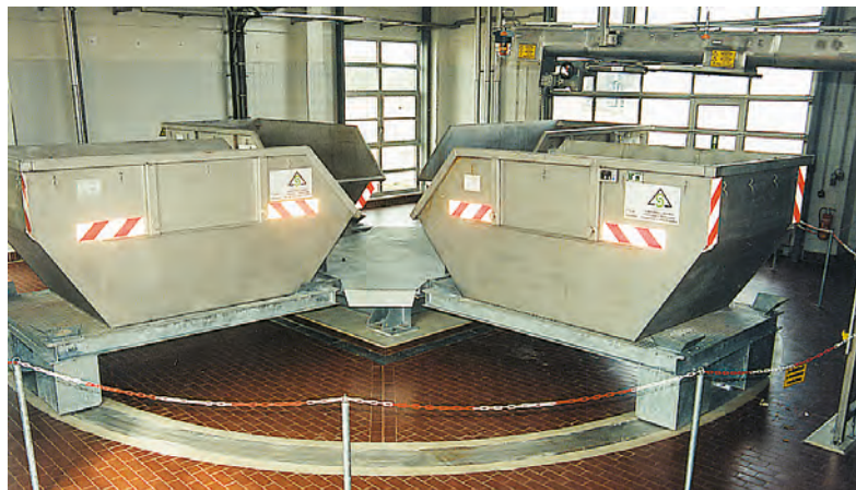
➤ 13 | Skip carousel

The final product of SOLIDIFICATION can also be casted into forms, compacted and get hardened to molds. The molds can be removed from the form/shattering after short period already, but the final strength will be achieved after approximately 30 days only. The hardened molds have a very low porosity. A water infiltration is not possible further on. Leaching is limited to the surface of the concrete block.