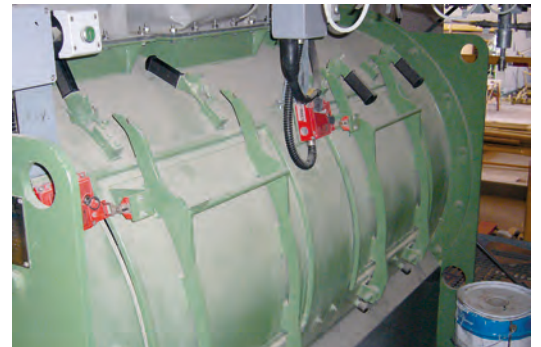
➤ 11 | Plough share mixer (Batch mixer)

The transport and the loading of the final solidified product are executed via belt conveyors in general. For the homogeneous and complete filling of skips various types of PURATEK belt conveyors are available: