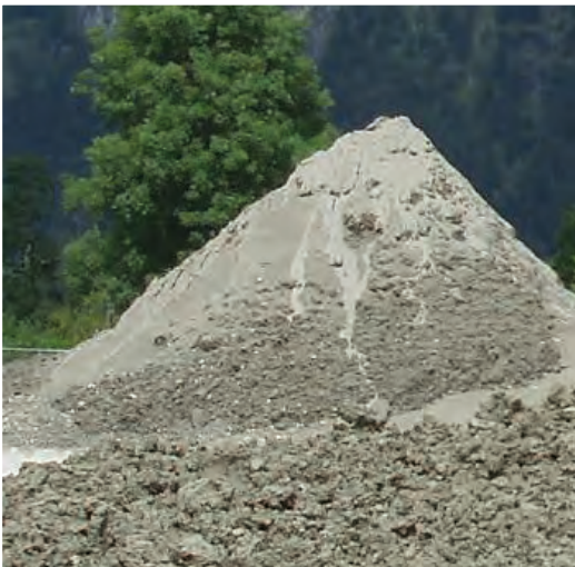
➤ 05 | Various Input Material (inorganic solids, heavy metal containing sludge, sewage sludge)