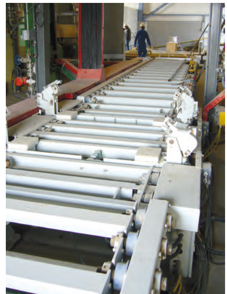
➤ 14 | Roller conveyor system for handling of forms/shattering (automatically operated)

The filled forms/shattering are transported via a roller conveyor system out of the SOLIDIFICATION unit. At the end of the roller conveyor system the filled forms are picked up by a fork lift and transported to the hardening area.