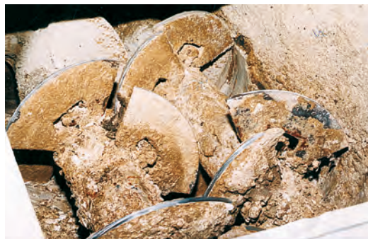
➤ 09 | Double shaft mixer in operation

The required mixing and the required retention time is controlled via the size of the mixer or the filling level of the mixer, the rotation speed of the mixer shaft(s) and the adjustment of the mixing tools.