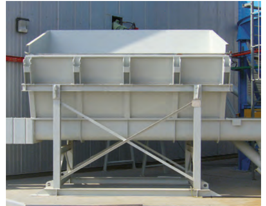
➤ 06 | Feed Hopper

The discharge of the material from the feed hopper is carried out via a double screw conveyor. The throughput will be adjusted via a manual adjustable gear box or a frequency inverter in accordance with the required throughput and the specification of the input material.